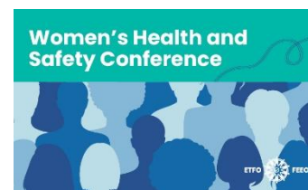
Women's Health and Safety Conference